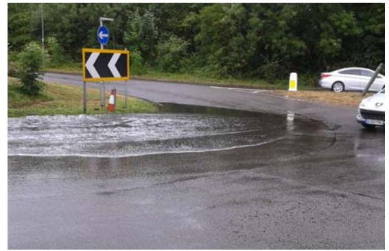
Flooding at Belmont roundabout A217 Brighton Road, before installation

T 0115 944 1448 F 0115 944 1466 E info@stanton-bonna.co.uk W www.stanton-bonna.co.uk