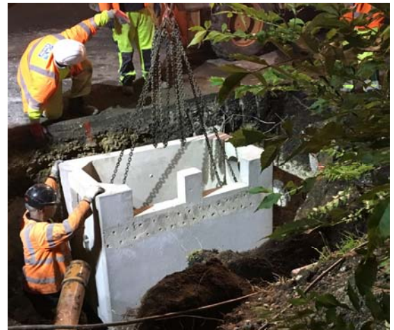
SUPERGULLY installed overnight to minimise road disruption