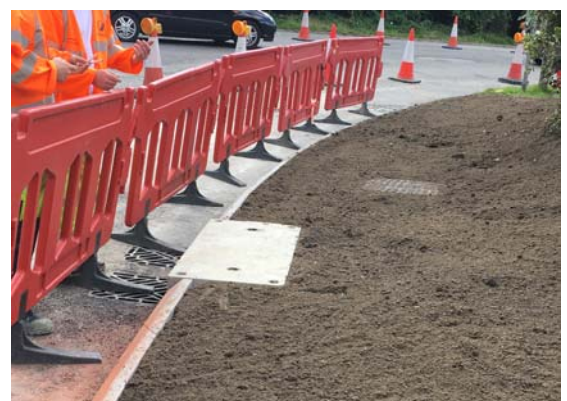
Completed within kerb line, ground level and roundabout surface.