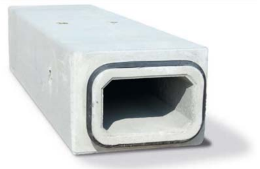
Box Culverts and AquaCulvert pictured below

Please contact us to discuss your project.